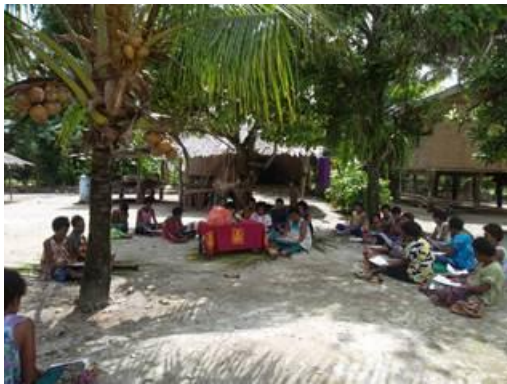
Dozens of women were eager to study God's Word