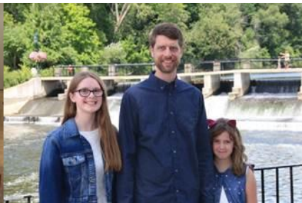
Winter, Dann & Hope