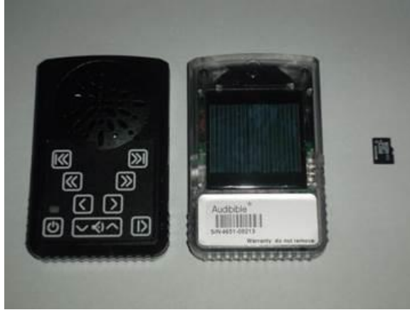
AudiBible (mini-solar panel on the back) and micro-SD card

We are able to purchase these and micro-SD cards (for phones) from our media department here in PNG and have finished recording John onto these new devices. We will be traveling to the other 3 Tami villages to distribute them this next time in Malasiga or possibly later this year. We are excited about what God will do with His Word in audio format as it is heard for the first time by many in these other Tami villages, Wanam, Kalal, and Tamigidu. Please pray for a great harvest as seeds of truth are sown in many hearts.